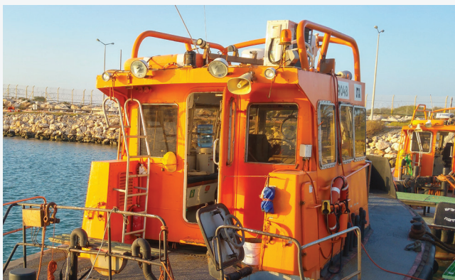
Marine seal | Tug-boats

split external seal for large shaft diameter