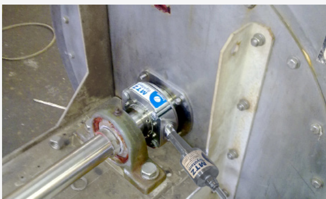
Blower | Power plant