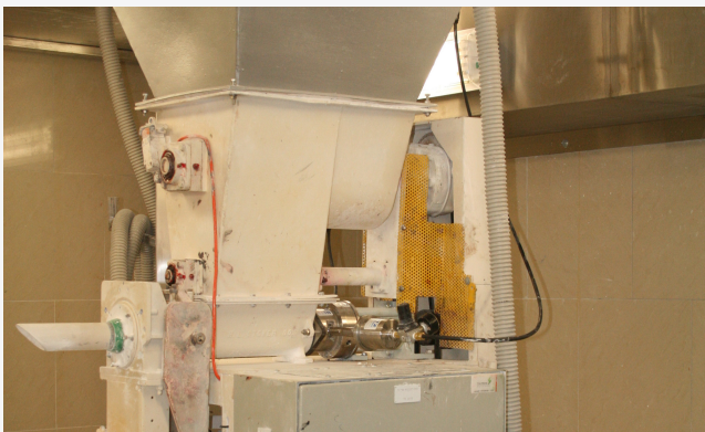
Packing machines | Chemical plant